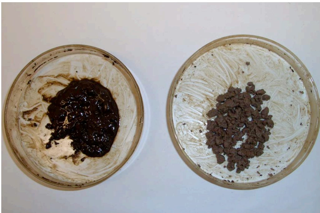
Photo The soil test before (left) and after (right) the Devoroil treatment after 4 weeks.