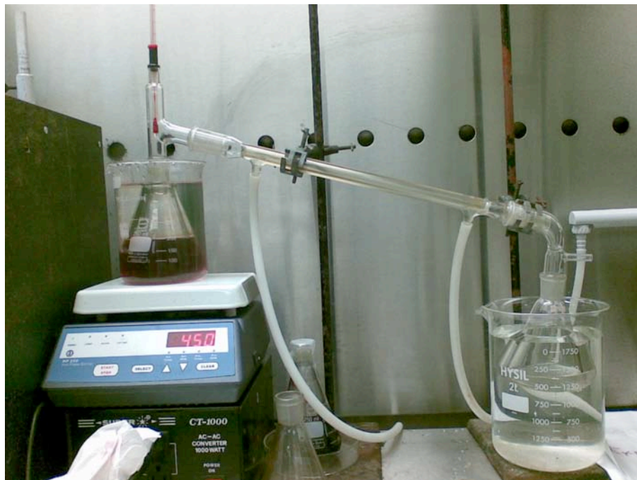
Photo The solvent distilled/recovery apparatus.